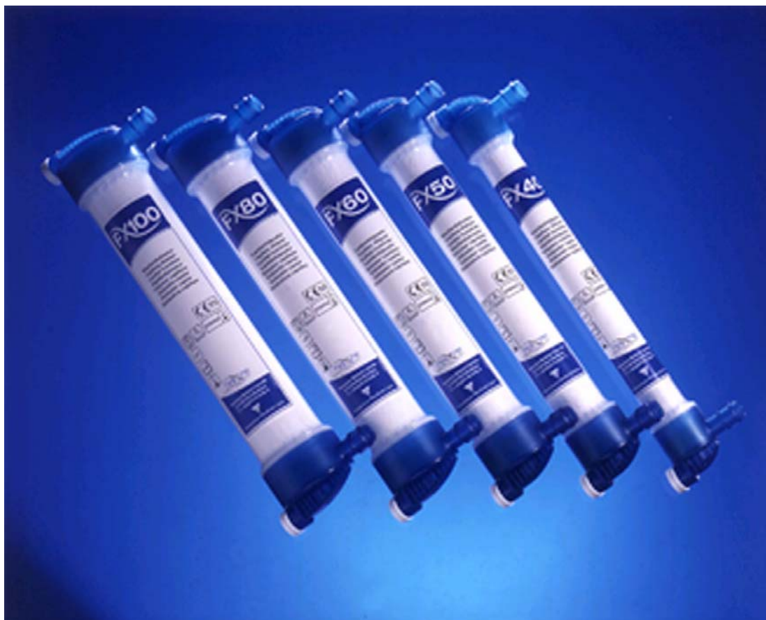
Fig. 2. Contemporary hollow fibre dialysers are available in a variety of sizes to meet differing clinical treatment requirements [Illustration courtesy of Fresenius Medical care, Bad Homburg, Germany.

permeable, yielding high filtration rates at low transmembrane pressures. Furthermore, they could be fabricated to provide good size selectivity, with a molecular cutoff of ca. 50,000 Da. Subsequent modifications of the manufacturing process of cellulose-based membranes have meant that today cellulose membranes are available for use in these therapies.