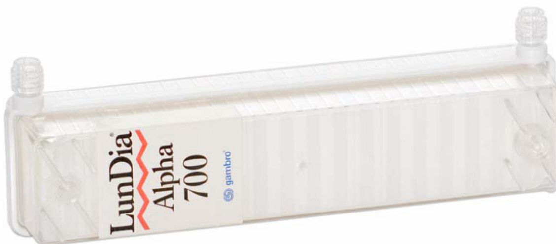
Fig. 1. Plate type dialyser utilizing sheet membranes supported on extruded polypropylene plates

Clinical use of the coil dialysers has declined, but parallel plate devices such as those shown in Fig. 1 continue to be used. The majority of patients today receive their treatment using a hollow fibre dialyser ( Fig. 2 ). In such devices, which are available in a range of surface areas to meet differing clinical requirements, the hollow fibres have internal diameters within the range 180-220 \mu\text{m} and wall thicknesses between 6 and 15 \mu\text{m} .