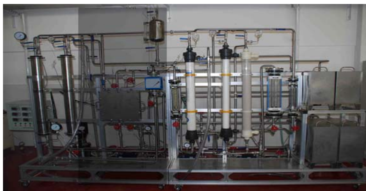
Fig. 1. Scene photograph of the self-designed multifunctional membrane separation equipment

The scaled up concentrating experiments were carried out using a flat-sheet cross-flow filtration apparatus, which is one part of the self-designed multifunctional membrane separation equipment. The available membrane area of the flat-sheet cross-flow module used was 0.063 \text{ m}^2 . The mass of permeate was measured using a scale. The cross-flow velocity was measured by a rotameter and it was controlled by changing the pump velocity or by adjusting the manual valves. The same valves and the pump velocity were used to control the trans-membrane pressure (TMP). Feed temperature (FT) was adjusted by a heat-exchanger. Figures 1 and 2 respectively show the photographic appearance and a schematic diagram of the multifunctional membrane separation equipment. The shaded region represents the flat-sheet cross-flow filtration apparatus used.