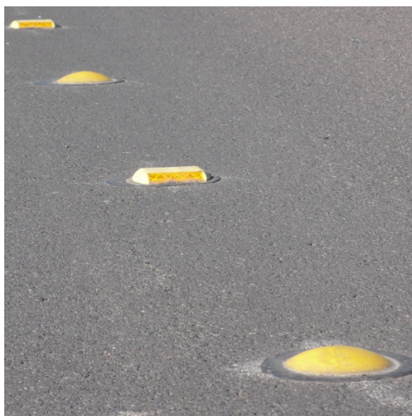
Fig. 3. Raised pavement markers

considered here is a simple round, domed marker. It is made from a non-reflective material and mounted with a bituminous or epoxy adhesive to an asphalt or concrete surface (ODOT 2010). The California Department of Transportation estimates that there are about 20 million Botts' dots on its roadways today (Caltrans 2010). That is enough to form a continuous line of Botts' dots stretching the length of US Interstate 5 from the US-Mexico border all the way to Tacoma, Washington.