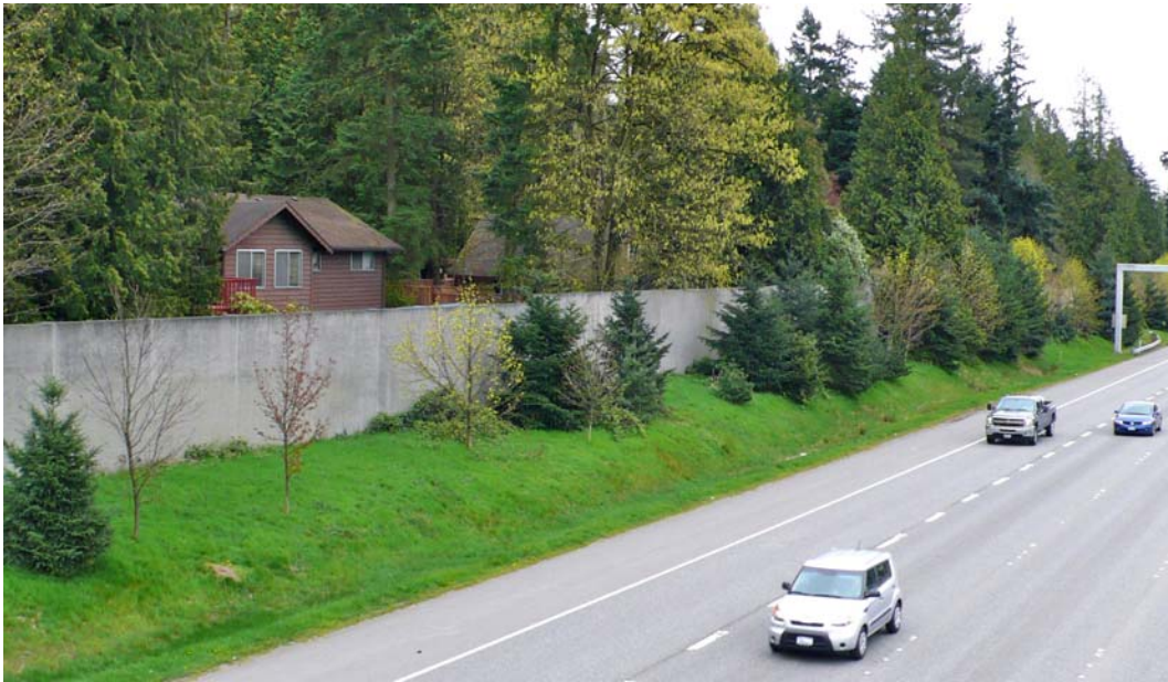
Fig. 5. A sound barrier wall

Sound barriers are structures along roadways used to mitigate noise from passing traffic, especially in residential areas (Figure 5). They are large installations designed for long service life. Performance characteristics of sound walls include sound transmission loss, structural requirements, weathering durability, and aesthetic acceptance (Land 2004). However in many cases they do not need to meet stringent collision requirements because they are generally offset from the road.