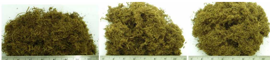
Figure 2. Refined bark fibers (Batch I, Batch II, and Batch III, as indicated in Table 5, from left to right)

When the plate distance decreased from 1 mm to 0.1 mm, the refined bark fibers became less coarse, as shown in Fig. 2. This result indicated that the bark fibers refined with a smaller plate distance were finer due to the smaller plate distance or larger mechanical force imposed on the bark, resulting in more friction between bark materials