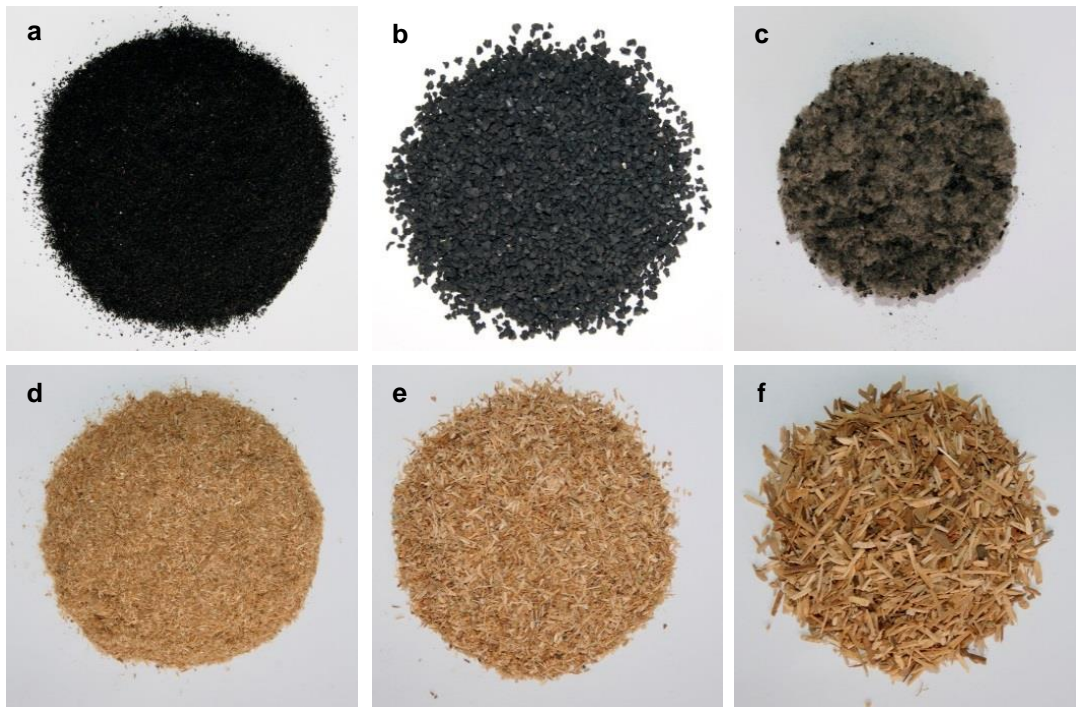
Fig. 1. Fine (a) and coarse (b) rubber particles, rubber-textile (c), and fine (d), medium (e) and coarse (f) wood chips. The rubber fractions (a) and (b) and the wood fractions (d) and (f) were used for cylindrical samples. The rubber fractions (a) and (b), the rubber textile (c) and the medium wood fraction (e) were used for production of bricks