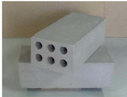
Fig. 3. Gypsum-based solid bricks with six symmetric round holes measuring 85 \times 55 \times 185 \text{ mm}^3 ( W \times T \times L ) and density of 580 \pm 23 \text{ Kg/m}^3

The density of the gypsum-based solid bricks (Fig. 3) was 580 \pm 23 \text{ kg/m}^3 . Taking into account that every brick has a known void volume (the holes represent 22.76% of the brick's volume) of 196.05 \text{ cm}^3 , the density of the material used for brick manufacturing was 750 \pm 30 \text{ Kg/m}^3 .