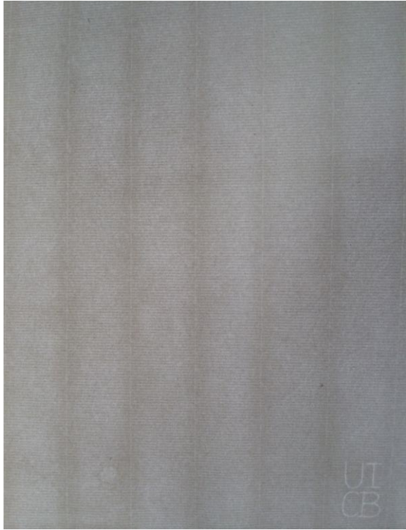
Fig. 2. Old linen rag