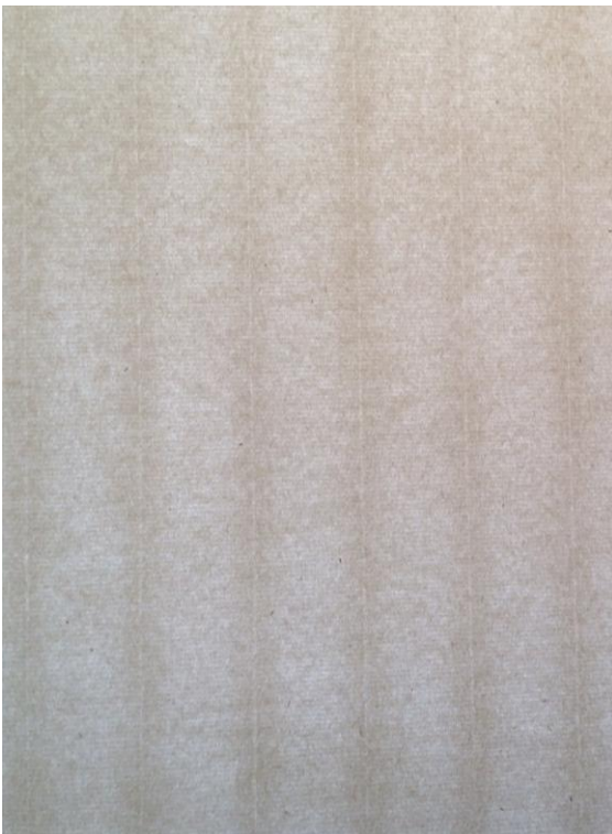
Fig. 3. 120 day fermented 50-50 hemp cotton