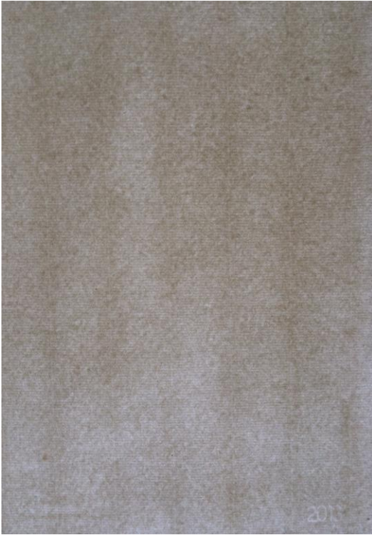
Fig. 1. 50-50 hemp/cotton unfermented