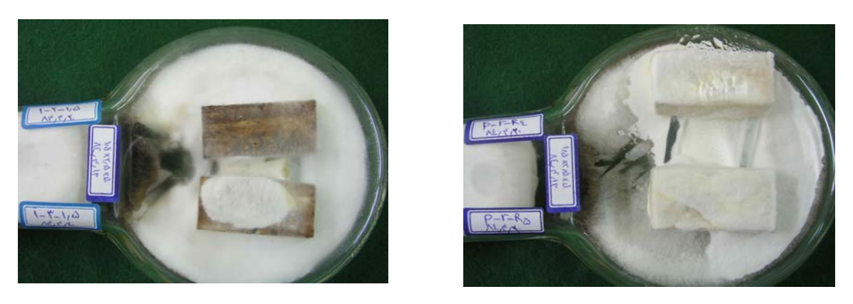
Figure 2. Mycelium growth of Trametes versicolor fungus on treated specimens with 1.5% extractives solution and decayed (left), and the untreated decayed specimens (right)

The Willeitner scale showed distinct evidence of fungal colonization (100%) on the specimens surfaces (Willeitner 1984). However, extractives treatment reduced the fungal growth (67% colonization) to a noticeable extent (Fig. 2).