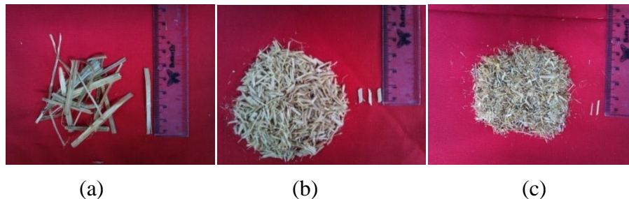
Fig. 1. Betung bamboo particles of various sizes: a) wool, b) medium, and c) fine

The culms of approximately 3-year-old Betung bamboo from the Lido, Bogor regency, West Java, were used in this study. As the raw material, the bamboo culms were cut into parts as long as 40 cm, sliced in half, and manually chipped. There were three size classes of particles used: fine, medium, and wool/excelsior particle (Fig. 1).