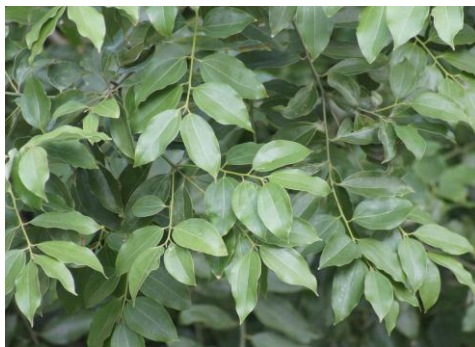
Fig. 1. Photograph of Cinnamomum osmophloeum leaves

Mature leaves of C. osmophloeum (Fig. 1) from 11 provenances (CO1 - CO11) were collected from the Tai Power Forest located in Taipei County (CO1), from the Haw-Lin Experimental Forest located in Taipei County (CO2 - CO5), from the Da-Pin-Ting of Taiwan Sugar Farm located in Nantou County in central Taiwan (CO6), and from the Lien Hua-Chin Research Center (CO7 - CO11). The species were identified by Mr. Yen-Ray Hsui of the Taiwan Forestry Research Institute, and voucher specimens were deposited in the laboratory of wood chemistry at the School of Forestry and Resource Conservation, National Taiwan University.