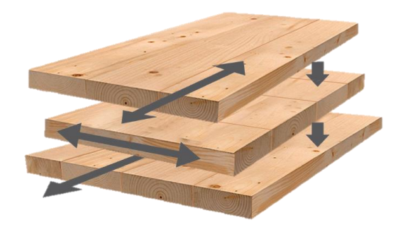
Fig. 1. Schematic of CLT layer configuration

Canada. Abundant information is available and is currently being generated regarding the technical aspects of CLT (Frangi et al. 2009; Gagnon 2011; Mohammad et al. 2012). However, little to no information about the market potential of CLT in the U.S. is available, making it difficult for entrepreneurs and early adopters to propose financing for development of the market in this country.