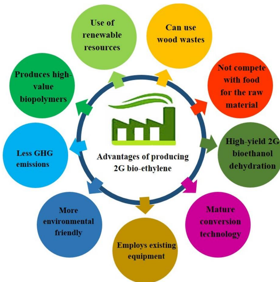
Fig. 3. The advantages of converting wood waste product to bio-ethylene

While the development of a biorefinery plant presents some challenges, it does offer some considerable advantages (Fig. 3).