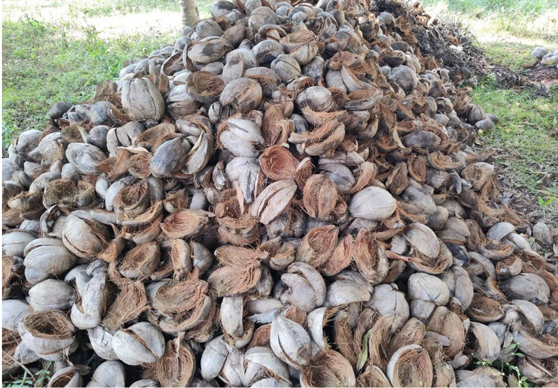
Fig. 2. Discarded waste coconut husks

Waste from the coconut-processing industries gives rise to numerous environmental problems. Waterlogged shells are reported to be breeding sites for mosquitoes, which can lead to epidemics of dengue fever or malaria in nearby communities (Dumasari et al. 2020). Other effects reported as reducing the life quality of the surrounding population include unpleasant smells and greenhouse gas emissions due to bacterial degradation of the coconut processing waste, a lack of storage space for the landfill sites, the clogging of natural watercourses and the destruction of the natural environment (Dumasari et al. 2020).